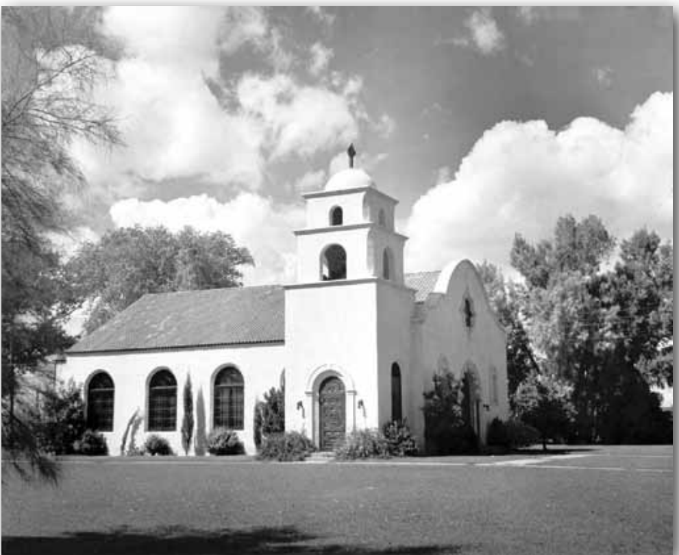
The Church in 1942