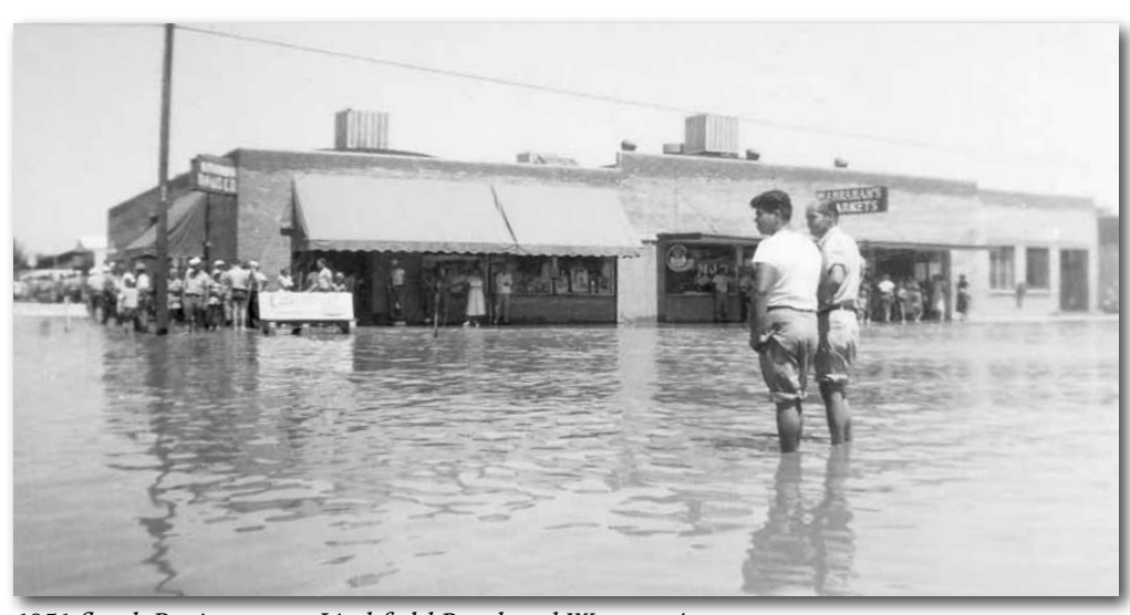
1951 flood. Businesses at Litchfield Road and Western Ave.

and heating room in the firehouse were damaged and the water supply was contaminated forcing the base to use an emergency water supply for 3 weeks. Base housing facilities, fencing and parking lots sustained damage. The estimated direct damage was $53,000.