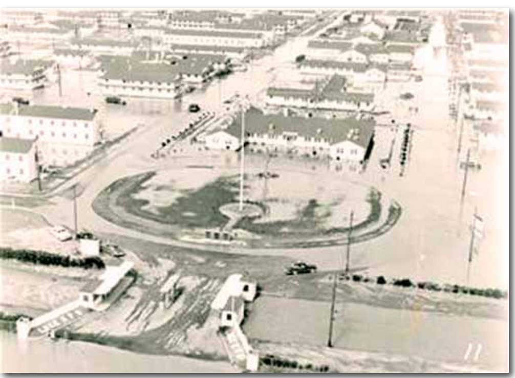
Flood at Luke AFB

The Litchfield Naval Air Facility sustained damaged roads, culverts and ditches. The generators in the auxiliary power plant